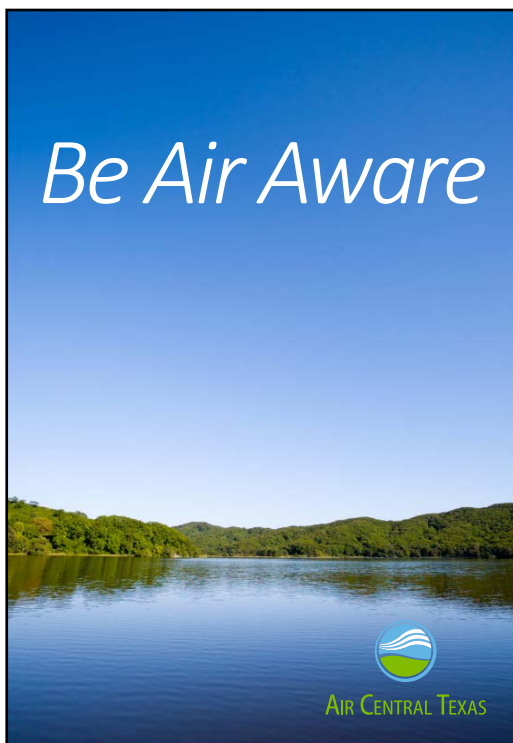
Example of “Be Air Aware” as the headline or main text in an advertisement or brochure.